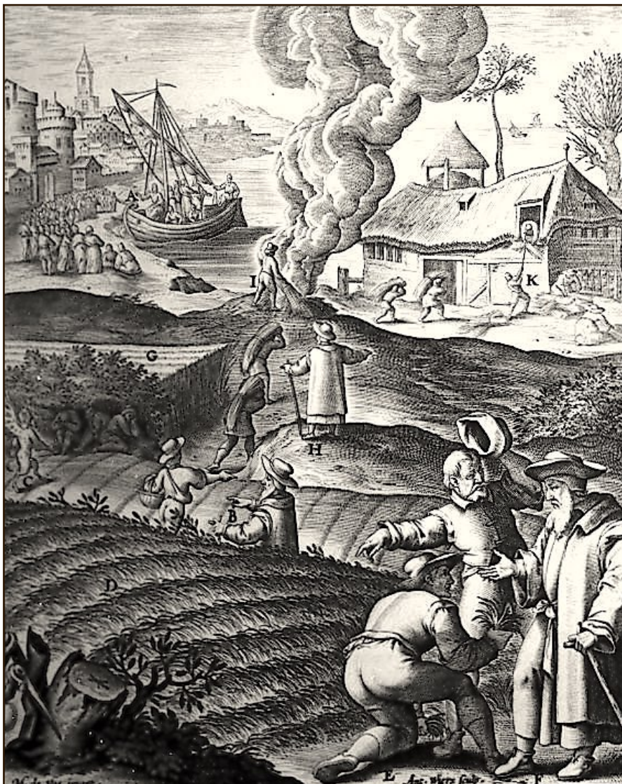
WOODCUT IMAGE - FR JEROME NADAL SJ - 1595

ST. VITUS CATHOLIC CHURCH - 607 4TH STREET SAN FERNANDO CA 91340