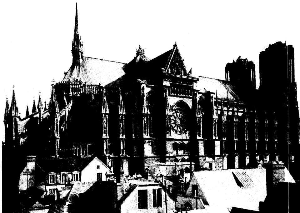
View from Northeast. Reims Cathedral, 1211—85.