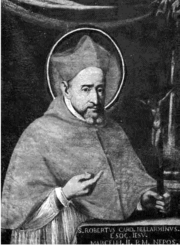
St. Robert Bellarmine, please pray for us at the Throne of God