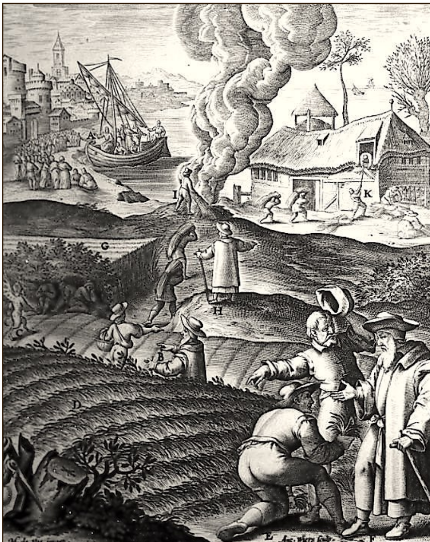
WOODCUT IMAGE - FR JEROME NADAL SJ - 1595

ST. VITUS CATHOLIC CHURCH - 607 4TH STREET SAN FERNANDO CA 91340