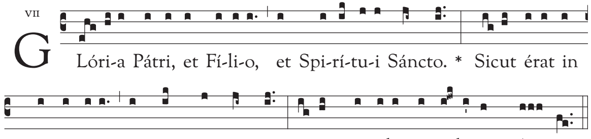
princí-pi-o, et nunc, et semper, et in saécula saecu-lórum. A- men.

Antiphon Text: Unam pétii a Dómino, hanc requíram: ut inhábitem in domo Dómini ómnibus diébus vitae meae.