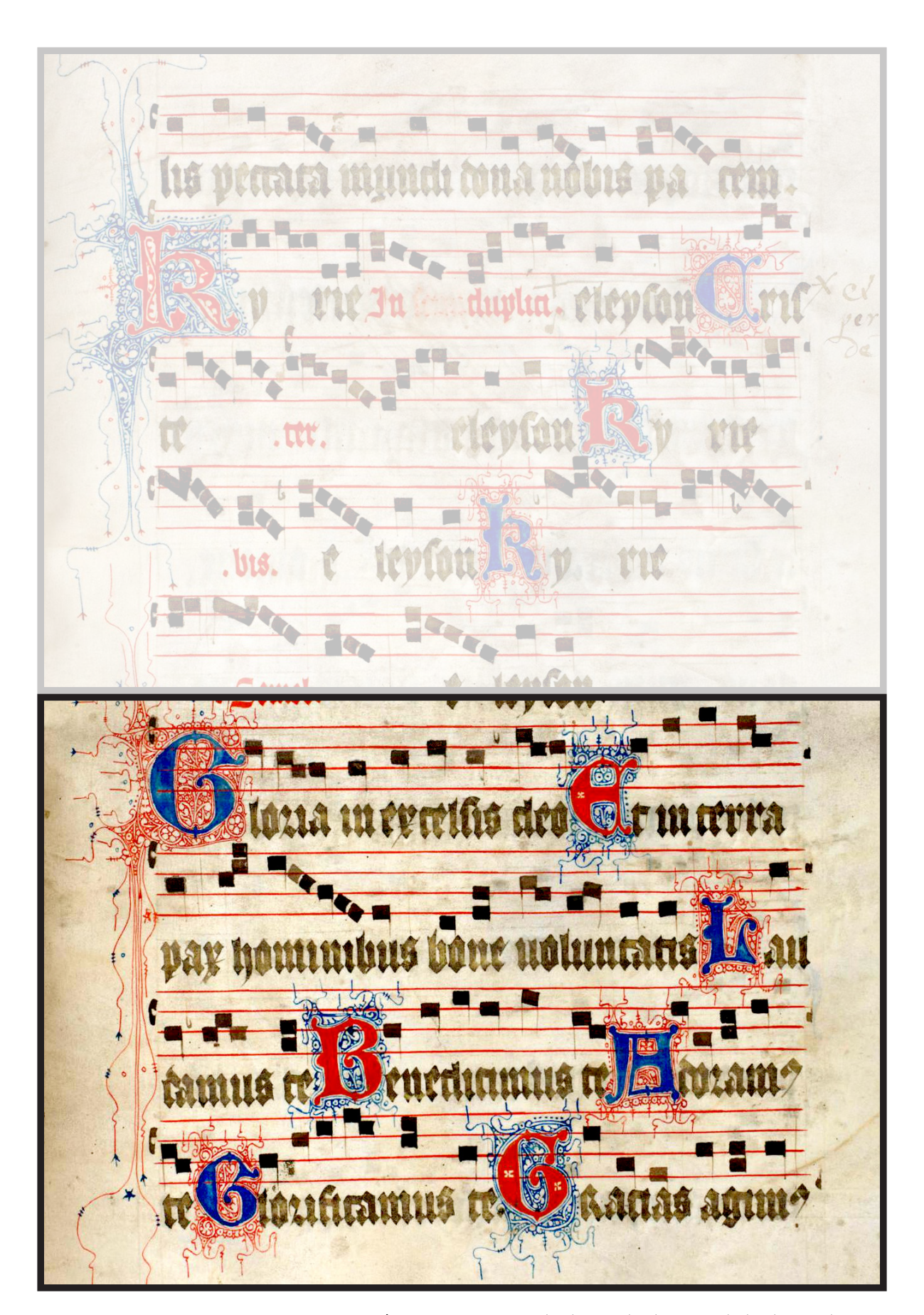
CCWATERSHED.ORG/HYMN • "Hands down, the best Catholic hymnal ever printed" —The New Liturgical Movement Blog (6/10/2019)