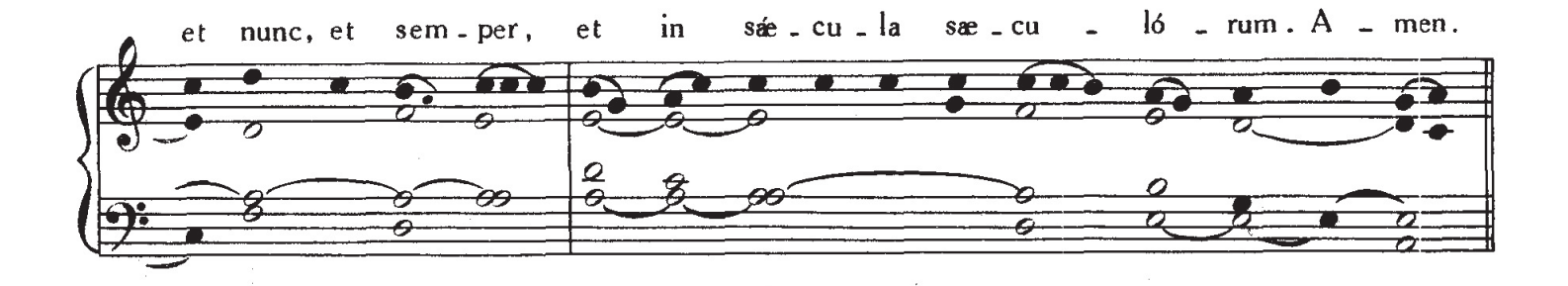
Thousands of Gregorian chant scores, videos, and more await you: ccwatershed.org