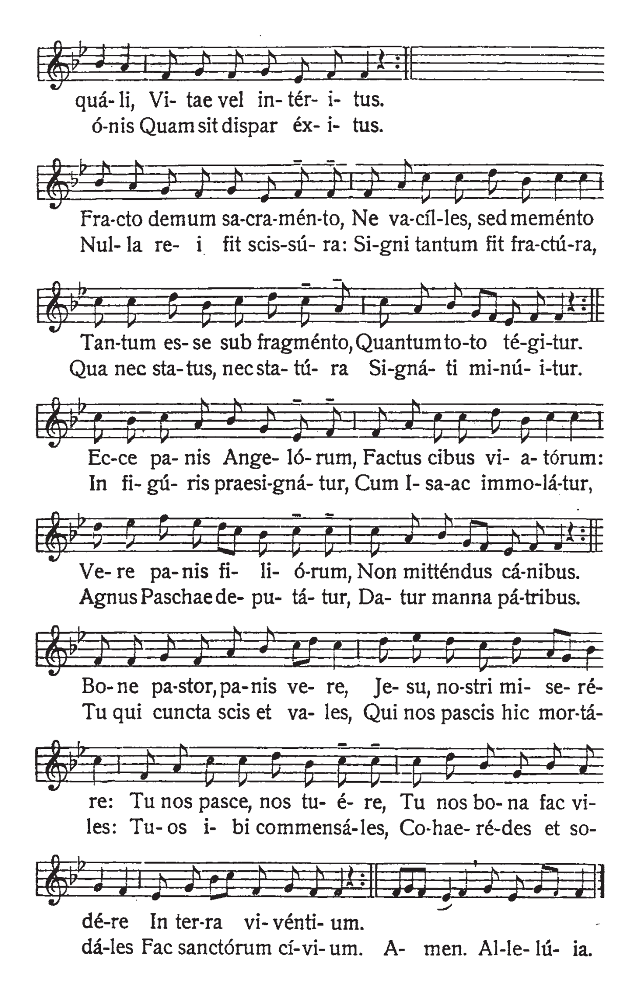
Thousands of Gregorian chant scores, videos, and more await you: ccwatershed.org