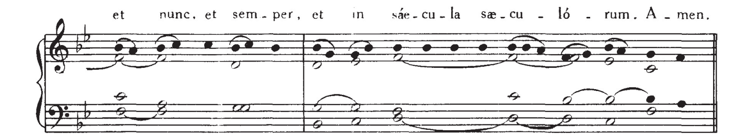
The only congregational hymnal for the Traditional Latin Mass: CCWATERSHED.ORG/CAMPION