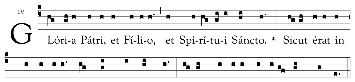
princí-pi-o, et nunc, et semper, et in saécula saeculó-rum. Amen.